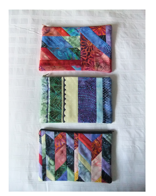
Judith Newman 2011